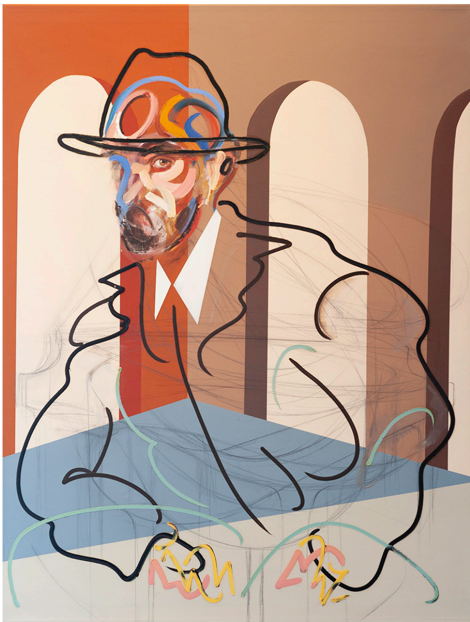
THE MAN FROM BRESCIA

2018 Oil and acrylic on canvas 122 x 92cm