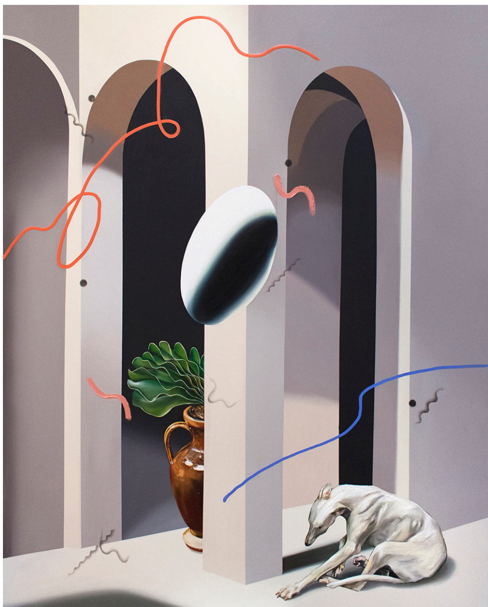
POST-INTERNET PAINTING #1

2020 Oil and acrylic on linen 152 x 122cm